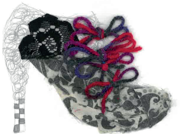
Kiren Jhinger. YR 1 LEVEL 3 fashion design, Gloucestershire college.